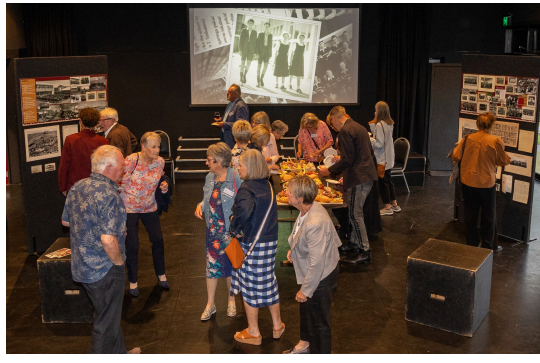
Catching up over drinks and nibbles