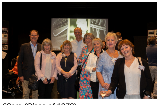
68ers (Class of 1972)