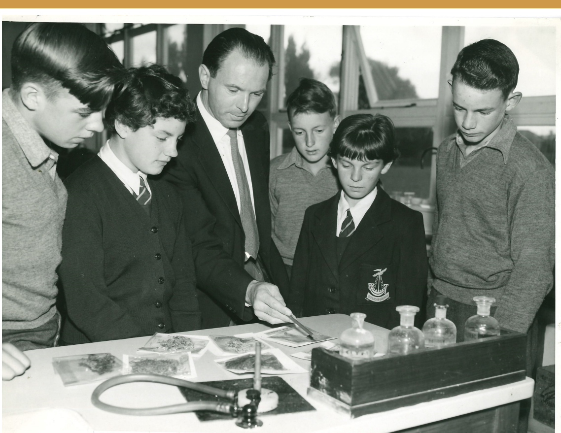
Science Class 1960