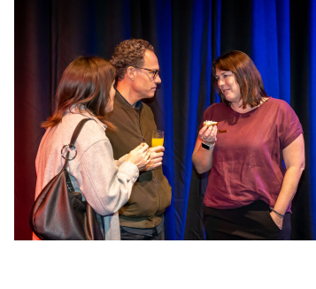
Farewell to our Principal