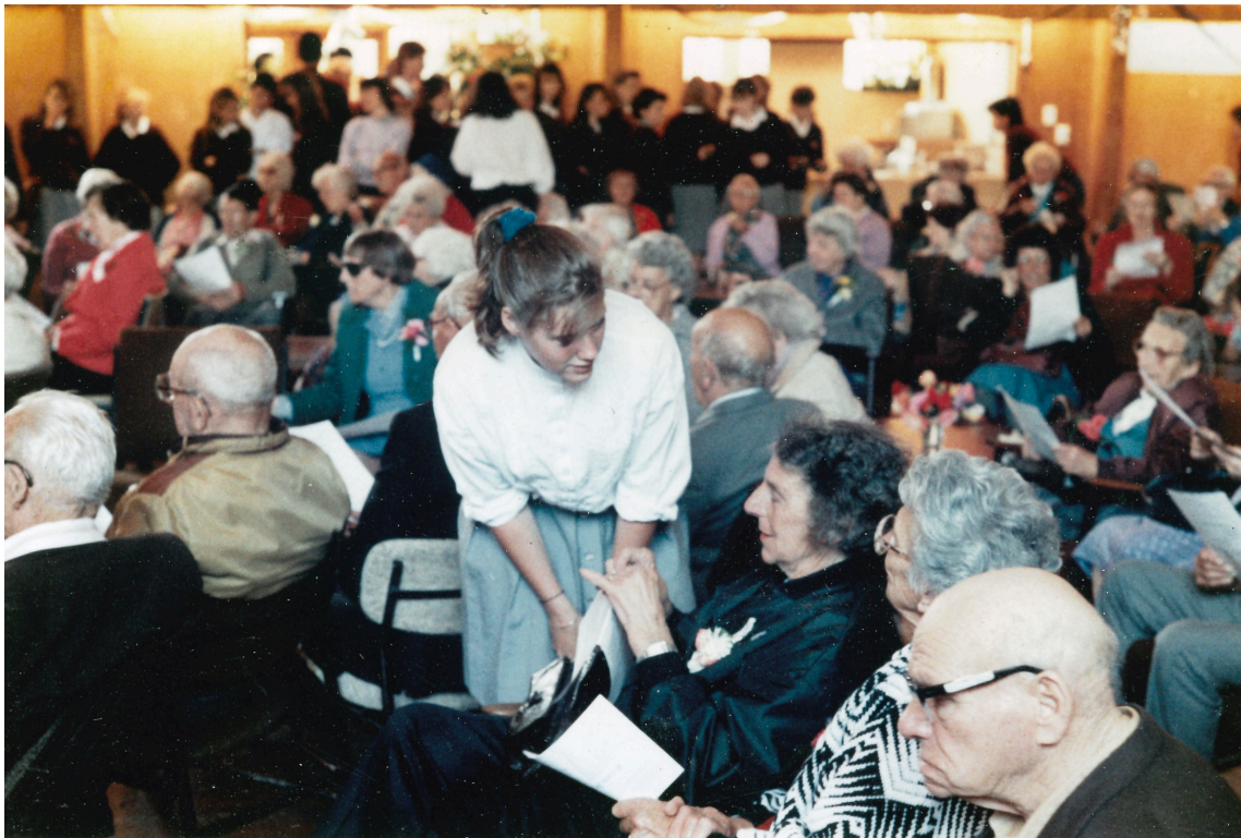
Senior Citizens Christmas Party 1989