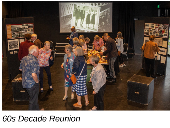
60s Decade Reunion