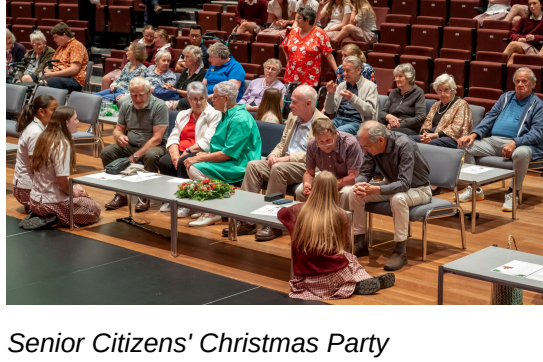
Senior Citizens' Christmas Party