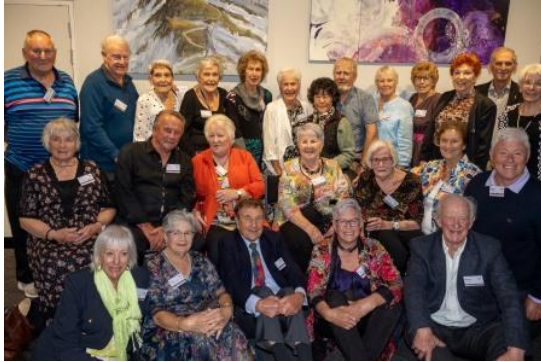
1956 and 1957 pupils at the 60s Reunion