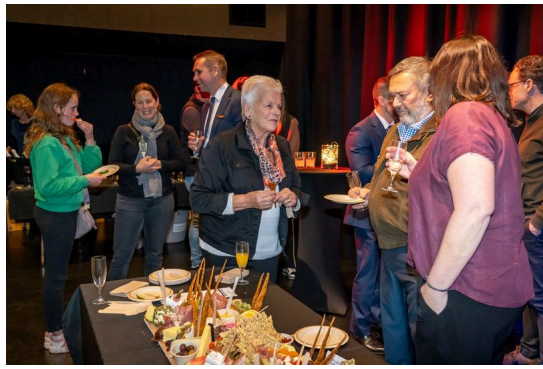
Oliver! Production Volunteer Night