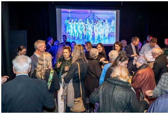
Oliver! Production VIP Night

Looking ahead to 2025 and beyond, we are excited to continue growing our alumni community. We are proud of the direction we are headed in, and have more exciting events and projects planned for next year to bring together the past and the present of our school.