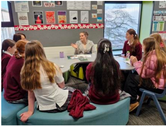
ABC Series 1